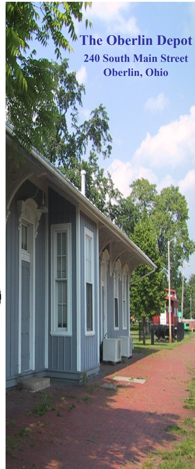
The Oberlin Depot 240 South Main Street Oberlin, Ohio

Additional parking is available on the north side of South Street, on the east side of S. Professor, north of South Street (Exception: Snow Ban) No Parking on S. Professor, south of South Street